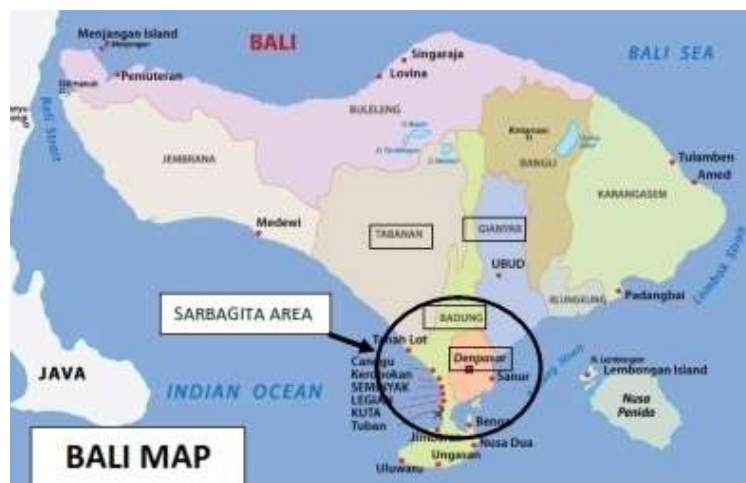
Figure 1 Study area

Unfortunately, the problem of urban freight transportation in Bali is very rarely discussed in social problems in Bali. Not much is known on how to solve the problem. The purpose of this research is to find a method to map the city based on its node and its logistics flow. Urban transport studies concentrate on the distribution of inter and intra-urban goods and vice versa (recycling and return of damaged goods) flowing in urban areas. Includes other logistics functions such as loading and unloading, consolidation, and goods terminals that function in the node between long haul transport and city distribution. This study also addresses the issue of freight transport in Bali, to provide an overview of logistic modeling patterns of nodes and flows. This study area as shown in Fig. 1