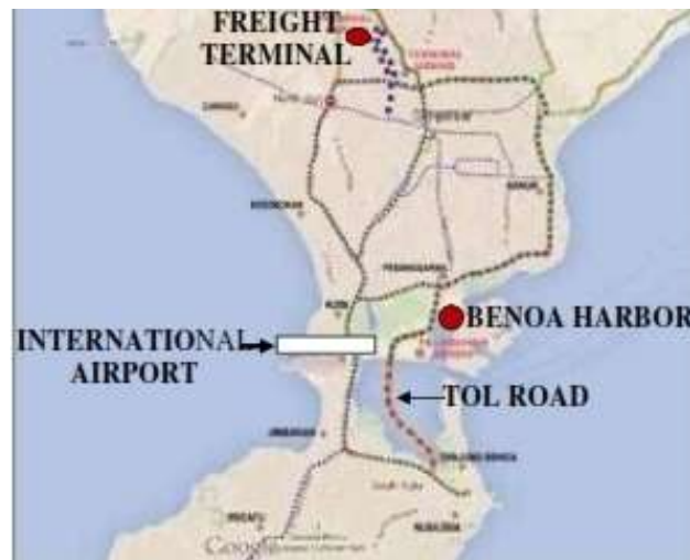
Figure 3 Fixed Facility Networks (Benoa Harbor, Ngurah Rai Airport, Freight terminal)

Skill networks; Network system expertise or skills required by both private and public, in this case the government until today has not been so intensively conducted it. As for example with regard to driver capability, standardized delivery service quality.