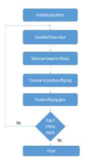
Figure 1. Various Steps of Genetic Algorithm

The algorithm will repeat until the population has evolved to form a solution to the problem, Or until a maximum number of iterations have taken place (suggesting that a solution is not Going to be found given the resources available. Figure 1 depicts the steps involved genetic algorithm.