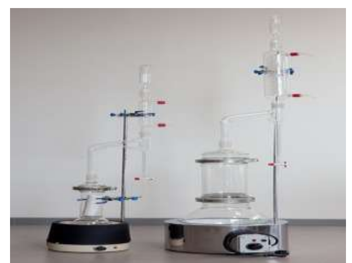
Fig. 2 Dean-Stark Setup