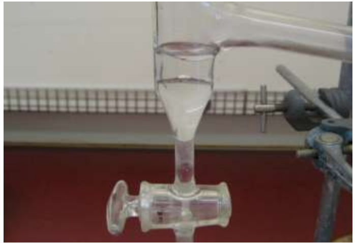
Fig. 3 Reflux

Regardless of the water determination methodology employed, several basic points need be followed. The application should be studied to determine the specific need for water determination and whether they can best be met by static methods or dynamic methods. Then, which specific method will provide the most desirable result. Then the best equipment/instruments should be selected to meet the requirements of the application. The equipment should meet all of the appropriate standards; such as, API, ASTM, US Coast Guard, Bureau of Land Management, Minerals Management Service, etc. The manufacturer's instruction should be followed in operating and maintaining the equipment. For Static methods, the appropriate analytical procedures must be properly followed. One should remember that the determination of the water content of the oil directly affects the revenue received for the oil.