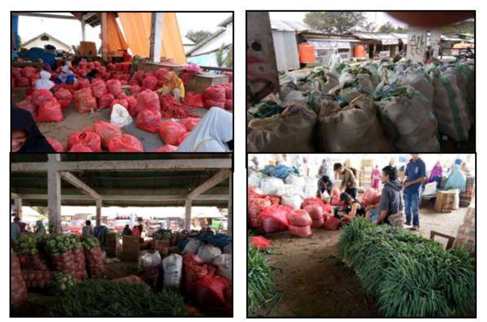
Figure 6. Packaging activities of vegetable commodities at STA Sumillan

The packing house building at Sub Terminal Agribusiness of Sumillan has never been functioned, has no equipment and facilities, so the building has since been closed only as shown in Figure 5.