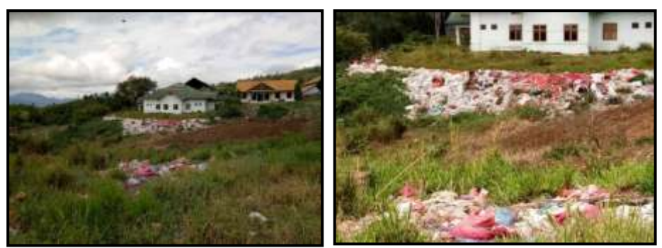
Figure 7. Waste disposal at STA Sumillan

Solid waste market waste in the form of vegetable waste, stacked beside Sub Terminal Agribusiness of Sumillan without further management as shown in Figure 7. Overcrowding caused pollution, nesting of pests and the incidence of unwanted odors.