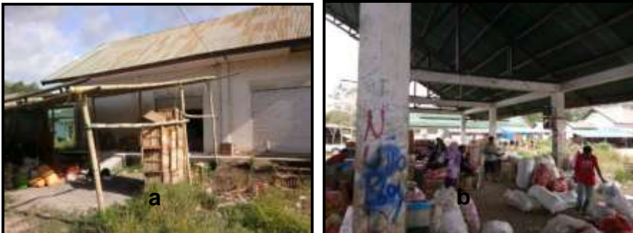
Figure 4. a) Storage warehouse conditions, b) commodities in wholesale vegetables

Figure 4 shows the storage warehouse of vegetable commodities in STA Sumillan never used, not even maintained, so that unsold vegetable commodities are only stored in vegetable wholesalers (natural storage) as in Figure 6.