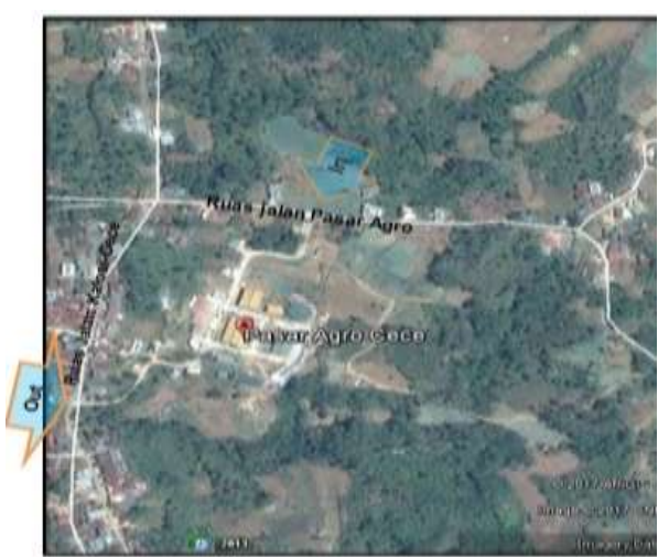
Figure 1. STA Sumillan Site

Sub Terminal Agribusiness of Sumillan is located in Sumillan Village, Alla Sub district located + 40 km from Enrekang City, located on an area of 21,953 m<sup>2</sup>, built in agricultural production, commodity in Alla Sub district, in accordance with the Spatial Plan of Enrekang Regency and the wishes of agribusinesses [5]. This location can be accessed through the primary collector road [14] on the Agro and Kalosi-Cece Market roads as shown in Figure 1.