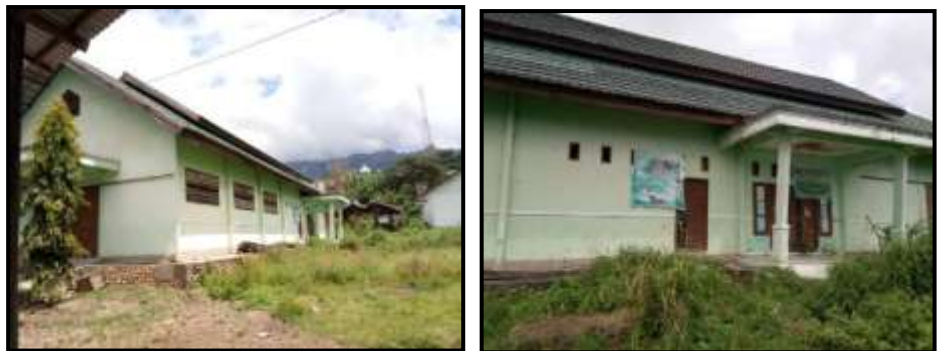
Figure 5. Building packing house at STA Sumillan

Figure 4 shows the storage warehouse of vegetable commodities in STA Sumillan never used, not even maintained, so that unsold vegetable commodities are only stored in vegetable wholesalers (natural storage) as in Figure 6.