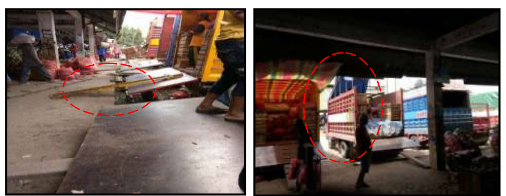
Figure 3. Loading and unloading activities of vegetable commodities

The condition of vegetable grocery building in STA Sumillan is a permanent building, with no walls, roof with steel structure and covered by corrugated sheet. The height of the roof cavity is 6 m. This area is used as a sorting place for vegetable commodities (sorting), packaging, and buying and selling transactions as in Figure 3.