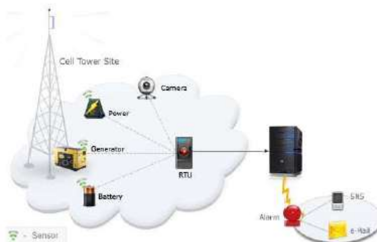
Figure 1. An over view of power management of cell site antennas