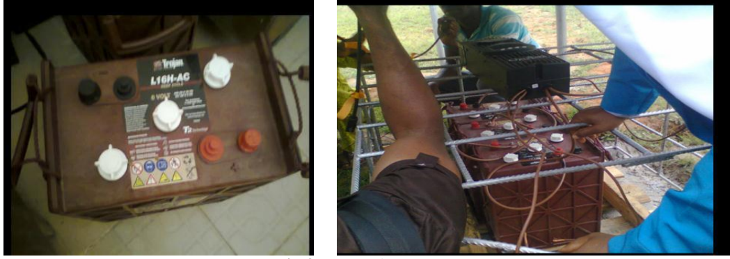
Fig.3: 6V Trojan Battery

We noted the battery sizing which is the capability of a battery system to meet the load demand with no contribution from the photovoltaic system. We chose our battery the 6V Trojan lead-acid with 435Amp-hr so that our stand alone photovoltaic system must maintain a continuous energy supply at night when there is no solar energy as shown in fig. 3.