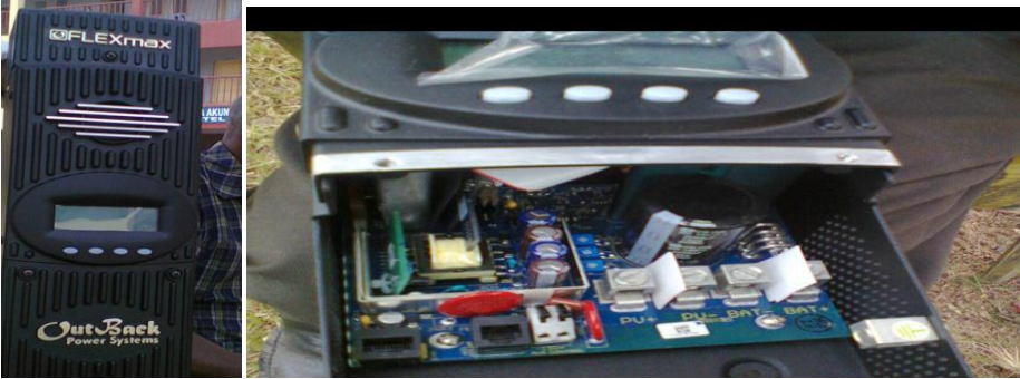
Fig. 4: The MPPT Charge Controller

The MPPT charge controller was used because it operates the PV panels at the voltage that delivers maximum power. That voltage will generally be higher than the voltage required to charge the battery, so the excess voltage is converted into extra current at the voltage demanded by the battery. Therefore, MPPT controllers as shown in Fig.4 not only maximize power extraction from PV panels but also allow tremendous flexibility in PV configuration.