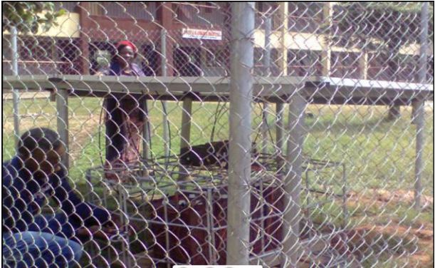
Fig. 5: The Cubicle

wire length. The six different lamp heads were mounted on galvanised pipes located at the farthest measured 88.5m while the nearest measured 20.6m.